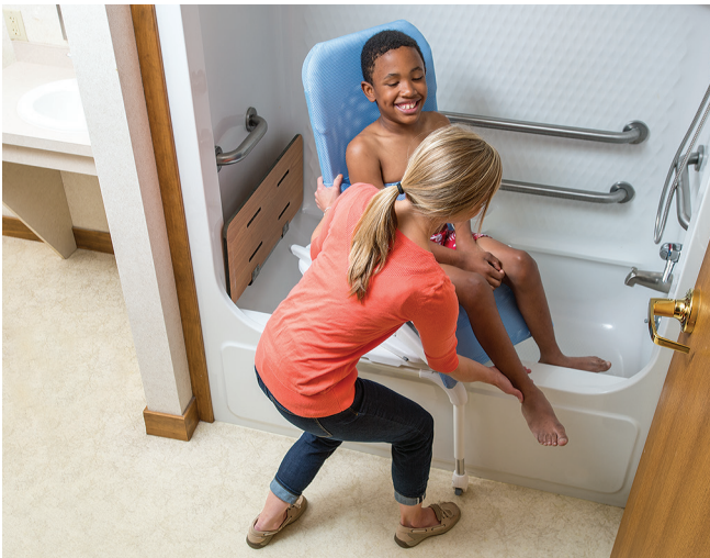
3. As the bath chair rotates, it continues to move back over the tub. Gently lift the client's legs to clear the edge of the tub.