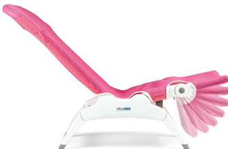
Highly adjustable Backrest angle, seat angle and calf rest angle adjust individually.