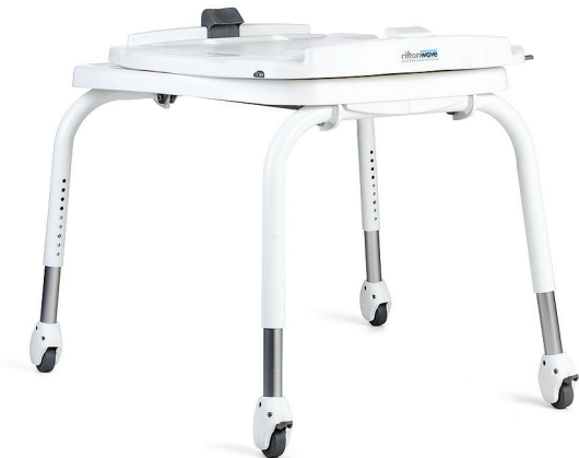
Tub transfer base